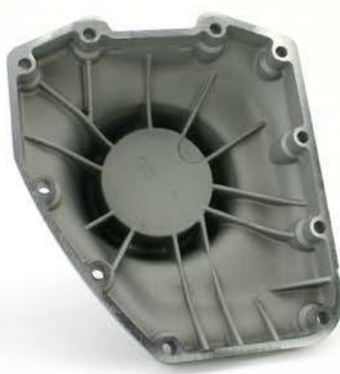
1999-2008, Cast with Support Ribs