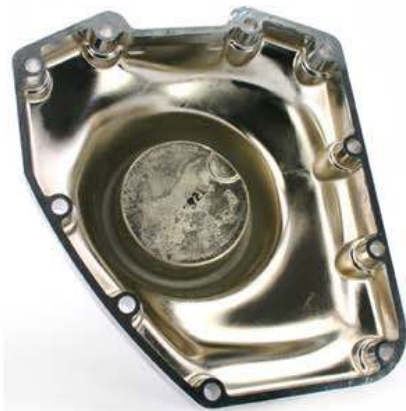
2009 - Up, No Support Ribs

Starting in 2009, the cam chest cover no longer is produced with support ribs, and no additional clearance is required.