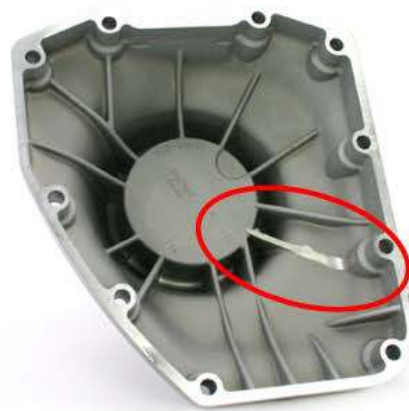
1999-2008, Single Rib Removed